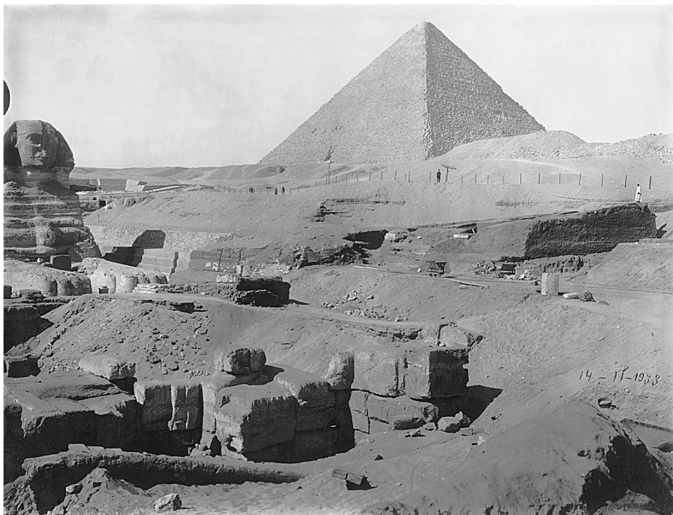
Fig. 2. Arch. Lacau Phot. CI n° 181.