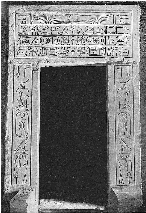
Fig. 7. Door 5 of the chapel of Amenhotep II (from Hassan, The Great Sphinx , pl. 25).