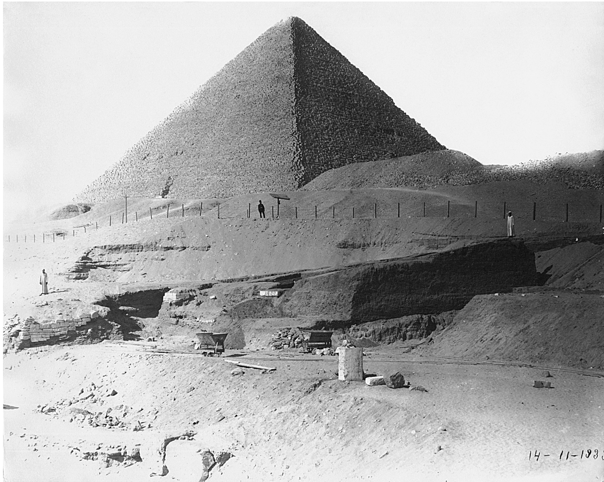
Fig. 3. Arch. Baraize Phot. (courtesy of the IFAO).

The first two photographs are similar shots to the Lacau photographs but with a narrower frame on the brick structure. The first (fig. 3) dates from the same day as the previous (11/14/1933), the second (fig. 4) gives a date of 12/7/1933, roughly a month later. On the latter, the monument is completely cleaned. All rooms (7) and corridors (2) were cleared and the remains of a limestone staircase were excavated at the entrance. Finally, the small section of wall made of limestone blocks visible to the left of the entry on the photographs of November was also cleared.