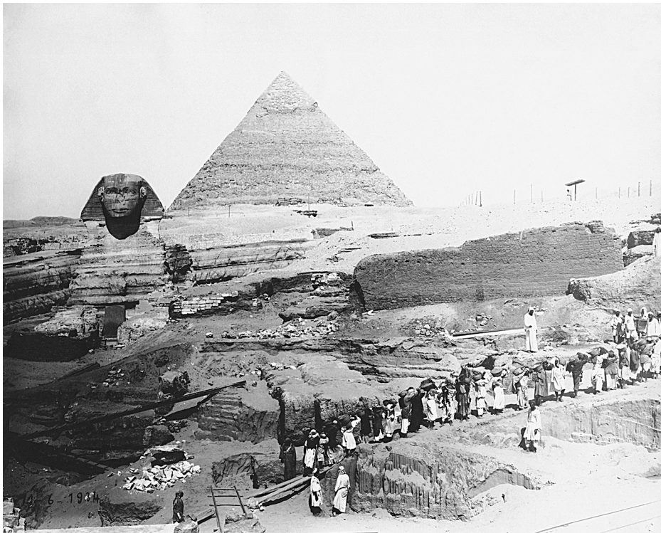
Fig. 5.