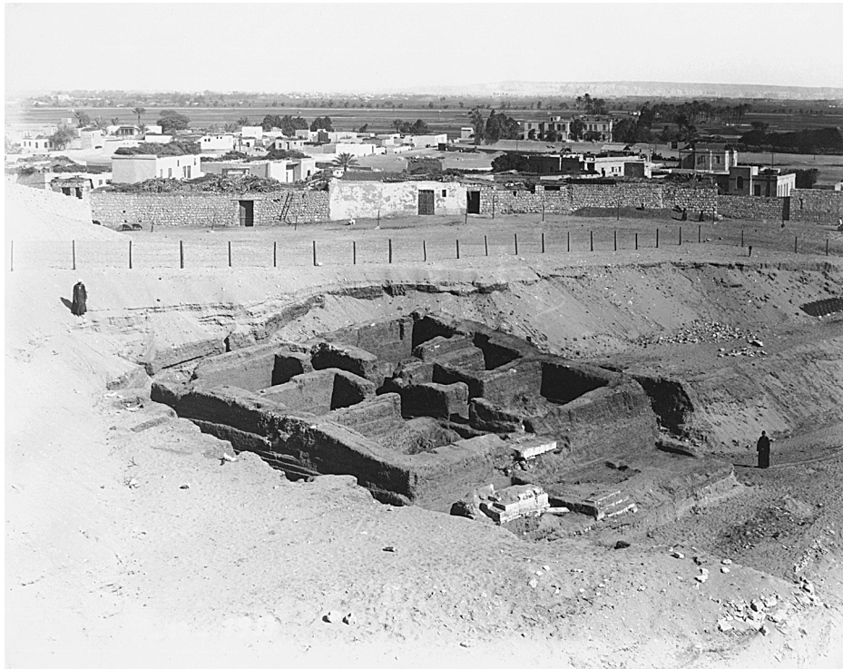
Fig. 4. Arch. Baraize Phot. (courtesy of the IFAO).