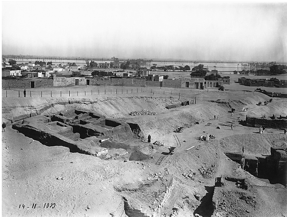
Fig. 1. Arch. Lacau Phot. CI n° 180 (courtesy of the W. Golénischeff Center-EPHE).