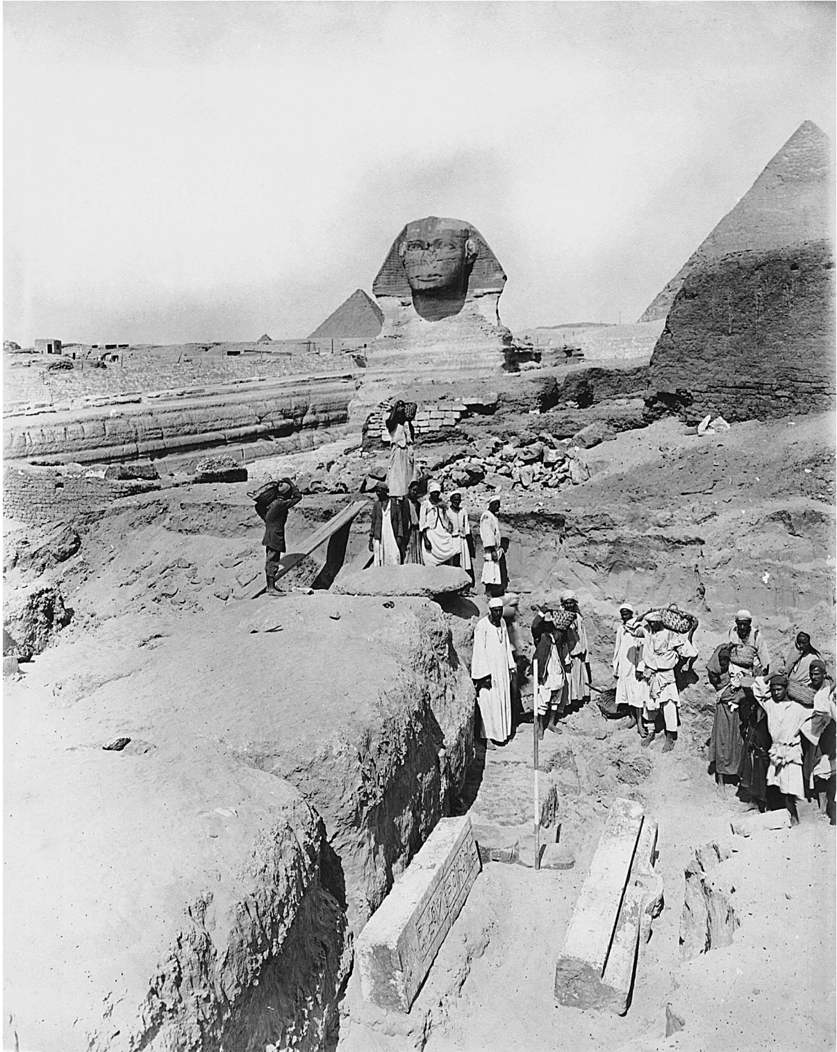
Fig. 6. Arch. Baraize Phot. (courtesy of the IFAO).